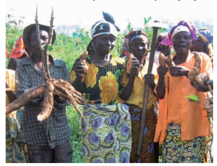
New land gives the Batwa farmers food and a stake in society

of the innovative Batwa Training Programme (BTP) in Rwanda. Since its launch back in 2007, the BTP has been providing indigenous