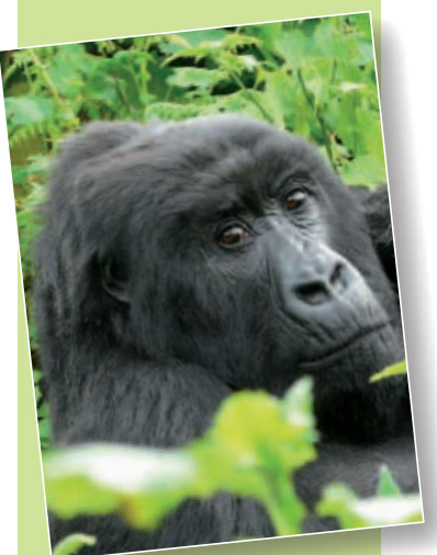
A landmark birthday for Amy

The Gorilla Organization's adopted mountain gorilla, Amy Akago, turned 18 on March 15. The elusive female mountain gorilla is still enjoying an extended 'gap year', flitting across the border between Rwanda and DR Congo, and is showing no signs of settling down any time soon! Learn how you can adopt Amy at www.gorillas.org