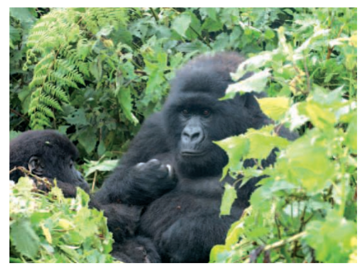
A single snare can devastate entire mountain gorilla groups

However, many front-line conservationists are wary of going too far in this direction, fearing that too much intervention could turn the Virungas into a 'wild zoo', with