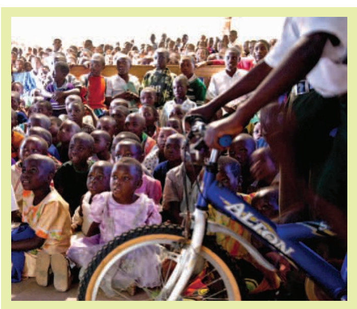
12 months, two wheels, 66,000 people: After just one year, the pedalpowered cinema project has brought gorilla conservation films to thousands of people living in some of Africa's poorest and most remote communities.