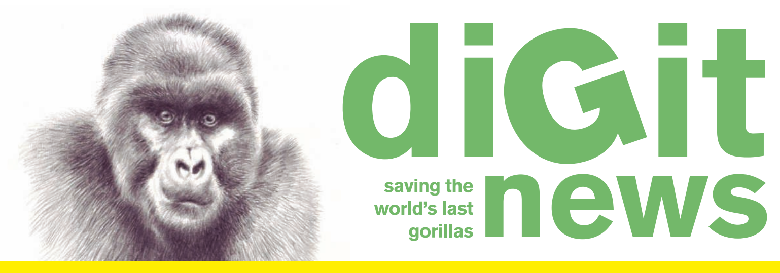
issue 42 autumn 2012