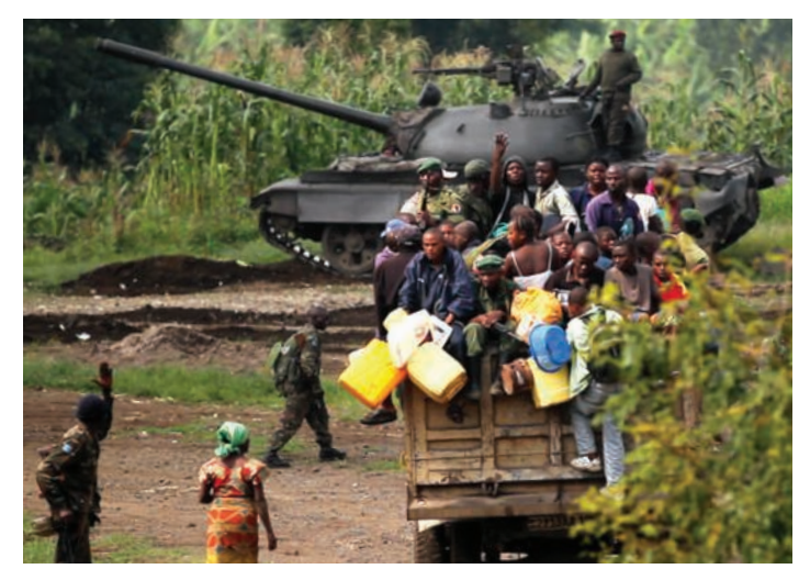
Thousands flee as violence engulfs DR Congo's Virunga National Park