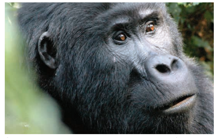
Gorillas will remain in peril as long as poachers enter the forests in search of food

their experience and knowledge of the forests, they were employed to clear paths for tourists to visit the five habituated gorilla groups living in the Nkuringo sector of Bwindi. However, opportunities in tourism are limited, meaning not all reformed poachers could be found work as trackers or porters.