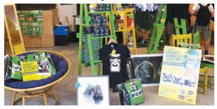
All of the stock on sale at the Carnaby store can also be purchased online at www.gorillas.org or through the merchandise catalogue